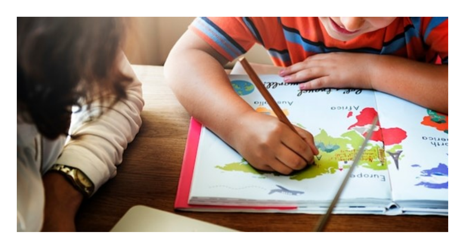
"While we try to teach our children all about life, our children teach us what life is all about."