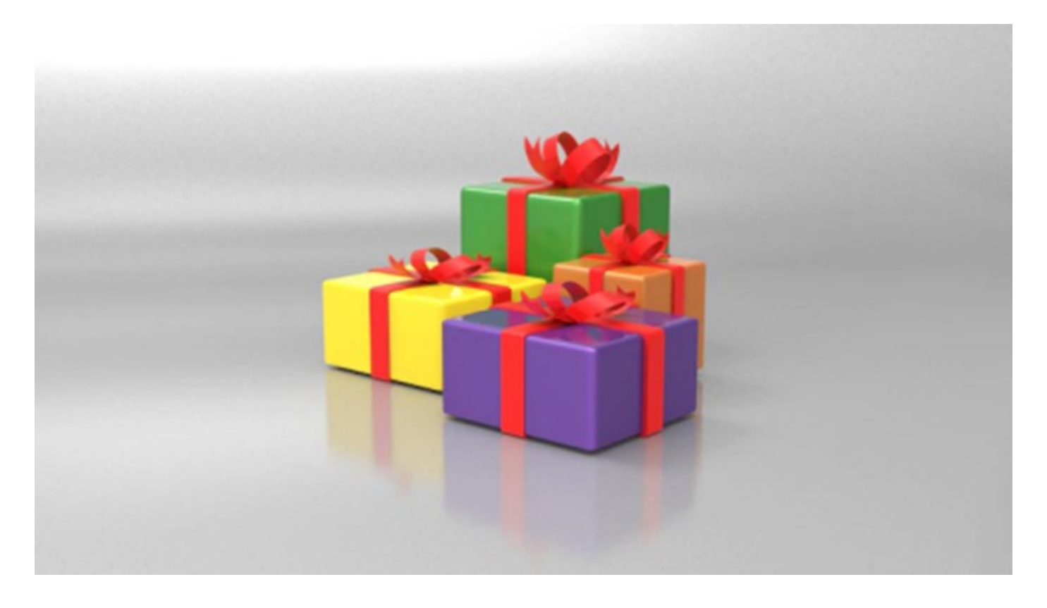
"Every child is gifted, they just unwrap their packages at different times."