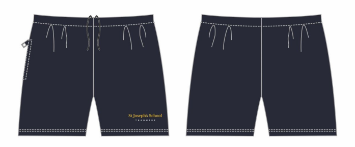
SPORTS SHORTS $28.00